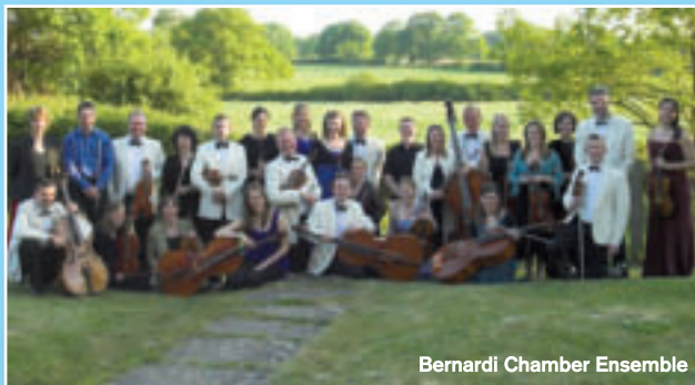
Bernardi Chamber Ensemble